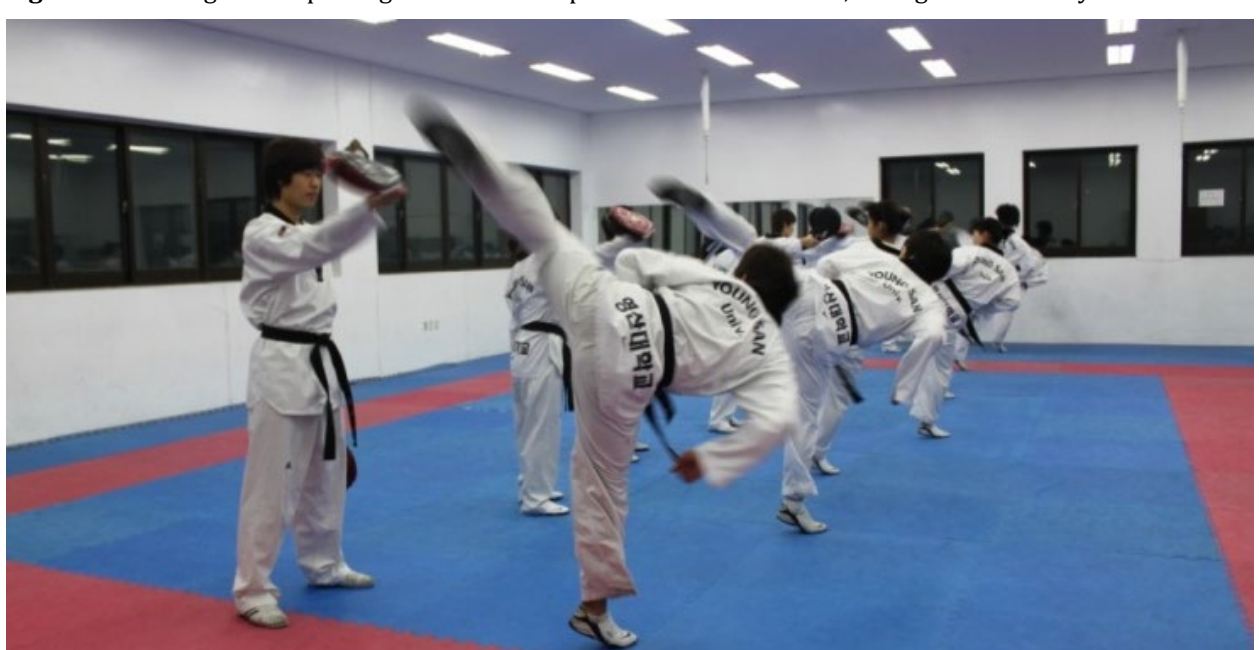
Figure 3. Training of the Sparring Team of the Department of Taekwondo, Youngsan University.