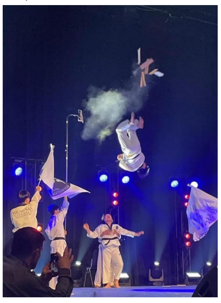
Figure 4. Gymnastic-like demonstration taekwondo of Youngsan University Demonstration Team.

contrast In to demonstration teams, the first university taekwondo p'umsae team was founded at Korea National Sport University only in 2006 (Korea National Sport University, n.d.). However, most universities with a taekwondo program feature now p'umsae teams next to sparring and demonstration teams. Forms training and competition is usually solo-performance practitioner of a set of prearranged striking and blocking techniques, in contrast to free sparring. World Taekwondo spurred a lot of the interest in p'umsae and by demonstration creating competitions for these specialties. addition, the division of taekwondo skills into specialties has been most likely facilitated by Korean universities by offering different educational tracks in their taekwondo departments. Moreover. these specialized students rarely train in the other disciplines, which raises question if this development actually benefitted general taekwondo education.