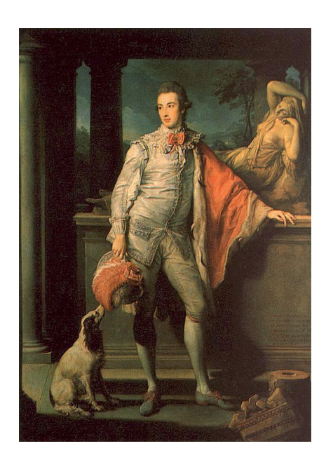
• Fig. 4. POMPEO BATONI: Thomas William Coke, later 1st Earl of Leicester, 1773-74, Oil on canvas, 245.8 x 170.3 cm.