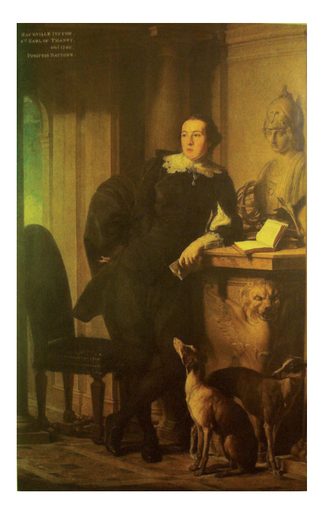
• Fig. 3. POMPEO BATONI, Sackville Tufton, 8th Earl of Thanet, 1753- 54, Oil on canvas, 233.7 x 147.3 cm.