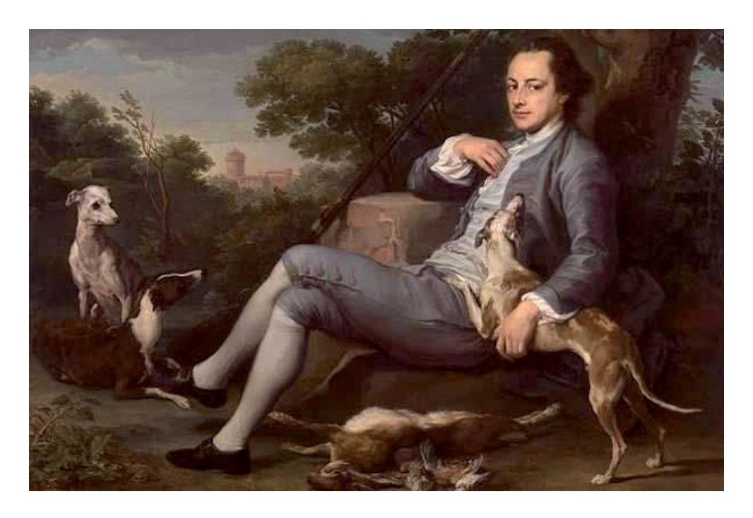
• Fig. 7. POMPEO BATONI, Sir Humphry Morice , 1761- 62, Oil on canvas, 117.5 x 172.8 cm.