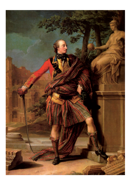
• Fig. 6. POMPEO BATONI, Colonel the Honorable William Gordon, 1765- 66, Oil on canvas, 259 x 187.5 cm.