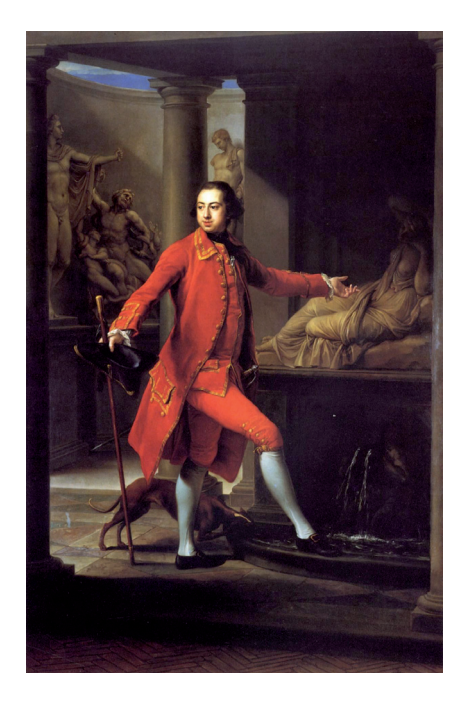
• Fig. 5. POMPEO BATONI: Thomas Dundas, later 1st Baron Dundas, 1764, Oil on canvas, 298 x 196.8 cm.