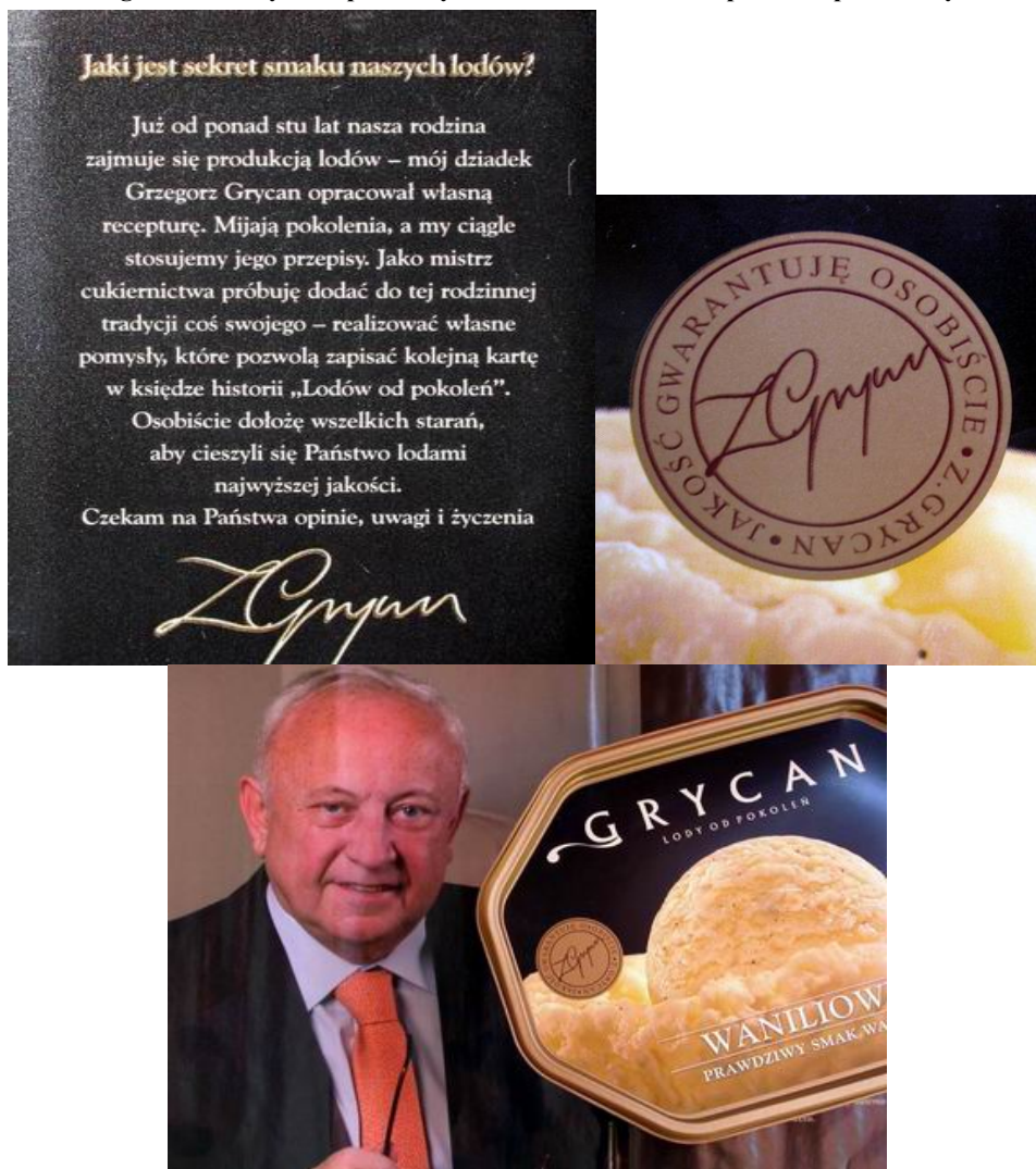
Figure 3. Family enterprise Grycan as home brand with powerful personality

company. Nevertheless, today, such values of an enterprise need a fully professional attitude and proper communication. Contemporary family companies have their reputation, tradition, culture which is not, however, fully reflected in a good image. One of the supreme examples of family firm, which constitutes all the major values of such company as well as can communicate them brightly, is Grycan, one of the leading brands in Polish premium market of high-quality ice cream. The main visual attributes of the strong brand image are presented in figure 3.